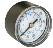
Manometro Pressure gauge