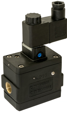
Avviatore progressivo Slow start valve