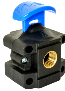
Valvola lucchettabile Dump valve with lock